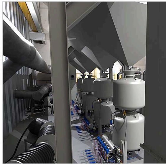
Blast room for shipyard.