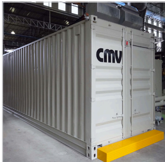
Blast room in container.