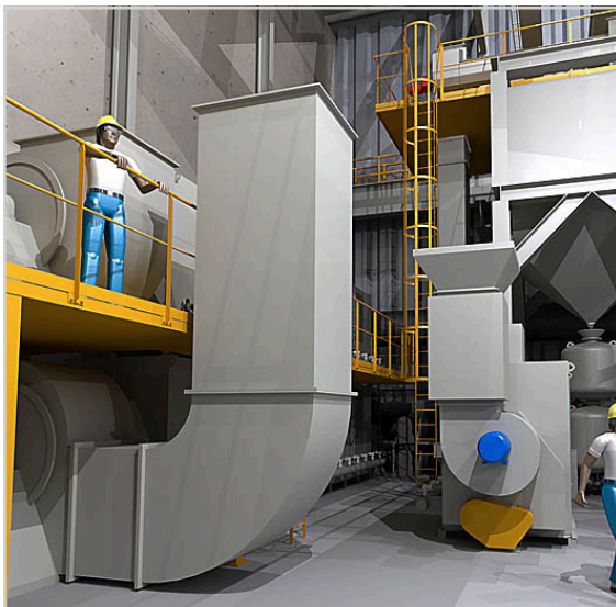
Blast room for shipyard.