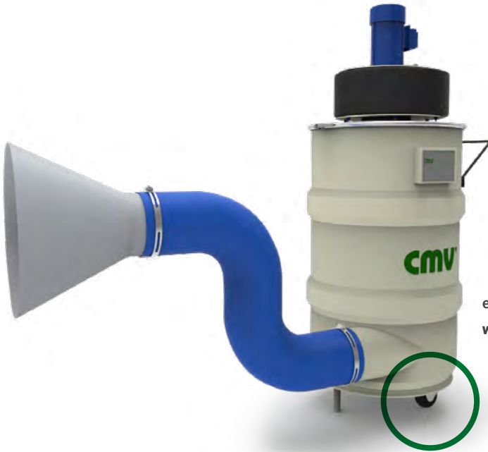
equipped with casters.

Our dust collector has the best performance in the market.